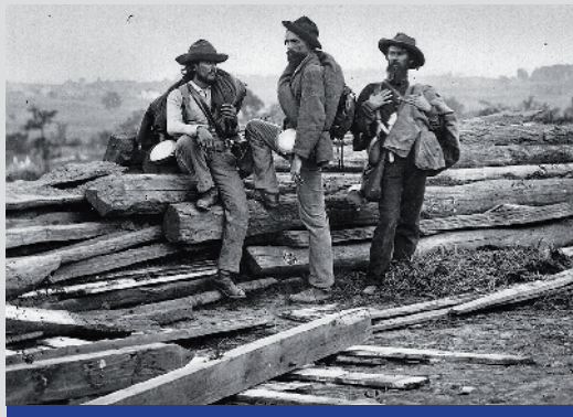
Pictures (all creative commons): Front: German POWs in Aachen, October 1944 Back: Korean soldiers and Chinese captives during the First Sino-Japanese War, 1894–1895 American POWs during the Bataan Death March, 1942 Confederate prisoners at Gettysburg, 1863